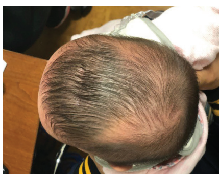
Endoscopic: Your child will have a 3 to 4 cm incision (about an inch and a half) over their affected suture. Incisions are closed during surgery with dissolvable stitches.

The appearance of the incision depends on the type of surgery your child had.