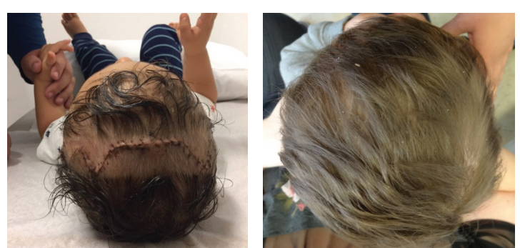
Cranial Vault Reconstruction: Your child will have a zig-zag incision from ear to ear. Incisions are closed during surgery with dissolvable stitches. The incision is designed to blend in once your child's hair grows back over the incision line.